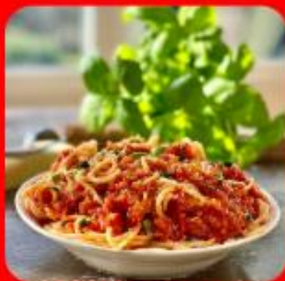
ITALIAN PASTA SAUCE