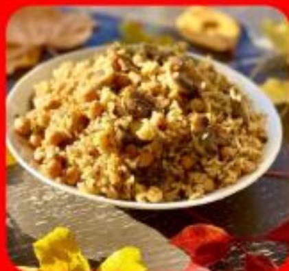
MIDDLE EASTERN PILAF