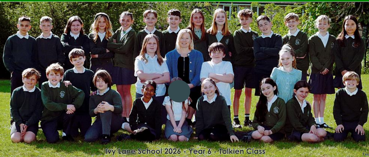
Ivy Lane School 2026 - Year 6 - Tolkien Class