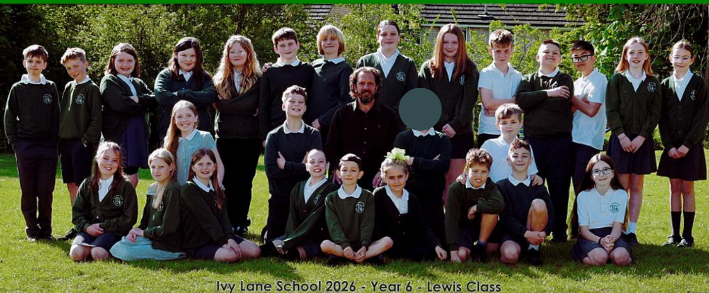
Ivy Lane School 2026 - Year 6 - Lewis Class